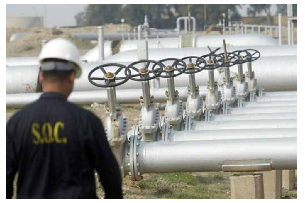
An engineer at the Zubair oil field on Jan. 21, 2010.

The project is 80 percent complete, the Samsung official said, and when finished will facilitate 200,000 bpd of new output and 130 million standard cubic feet of