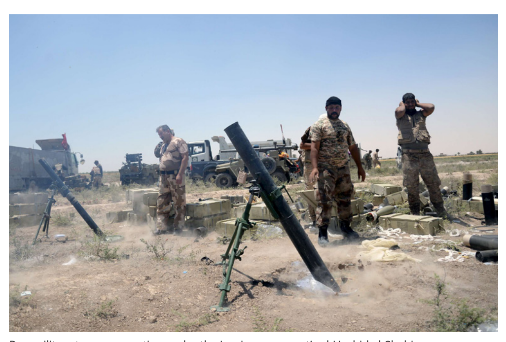
Paramilitary troops operating under the Iraqi government's al-Hashid al-Shabi program launch a mortar toward Islamic State militants north of Fallujah on July 6, 2015.

Syrian Democratic Forces (SDF) had created something of a buffer zone in eastern Syria between the Euphrates River and the Iraqi border, but in late October the Turk-