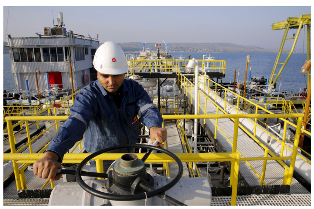
A worker checks the valve gears of pipes linked to oil tanks at Turkey's Mediterranean port of Cevhan.

Significantly, Kurdistan's oil sector recovery received a major boost by the entry of Russian state oil firm Rosneft. In early 2017, Rosneft began committing billions of