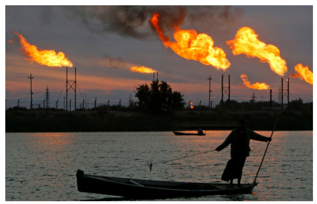
Flames emerge from flare stacks at the oil fields in Basra, Jan. 17, 2017.

10 YEARS OF INFORMING, ENGAGING AND EMPOWERING STAKEHOLDERS IN IRAQ | DECEMBER 2018