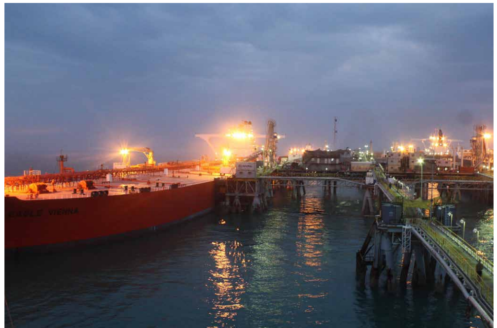
Tankers dock at the al-Basra Oil Terminal.

There are several reasons for this. They are known to many people. There are political, financial, and legal reasons. There are differences about the interpretation of some items of the constitution by our brothers in the region (KRG), which the federal government doesn't accept.