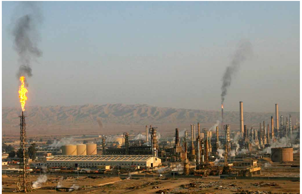
The oil refinery in Baiji, in 2009.

The revival of Baiji is likely to help Iraq unlock some stranded capacity in Kirkuk,