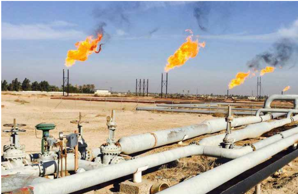
Flares at the Nahr Bin Omar oil field on Jan. 12, 2017.

10 YEARS OF INFORMING, ENGAGING AND EMPOWERING STAKEHOLDERS IN IRAQ | OCTOBER 2018