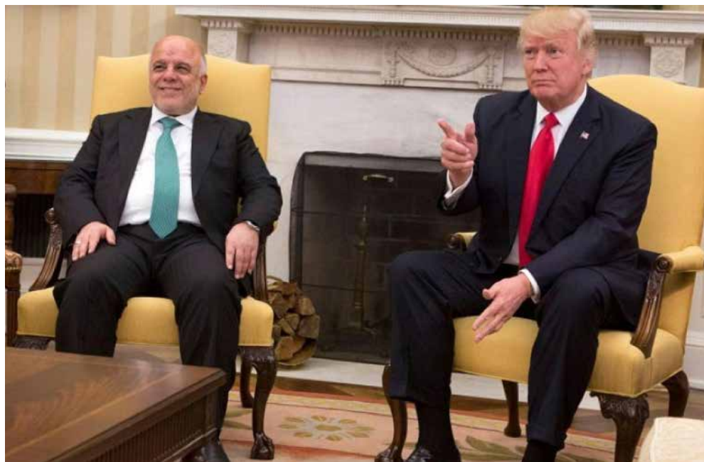
U.S. President Donald J. Trump greets Iraqi Prime Minister Haider al-Abadi at the White House on March 20, 2017 in Washington DC.

The importance of that power supply came into stark relief in July 2018, when Iran's direct power supply to Iraq dropped to approximately 100 megawatts. Iraqi officials sent mixed messages about the reason for the stoppage, with one Iraqi electricity official saying it was because of unpaid bills to Iranian companies, and another official saying it was because of Iran's struggles to meet its own domestic demand.