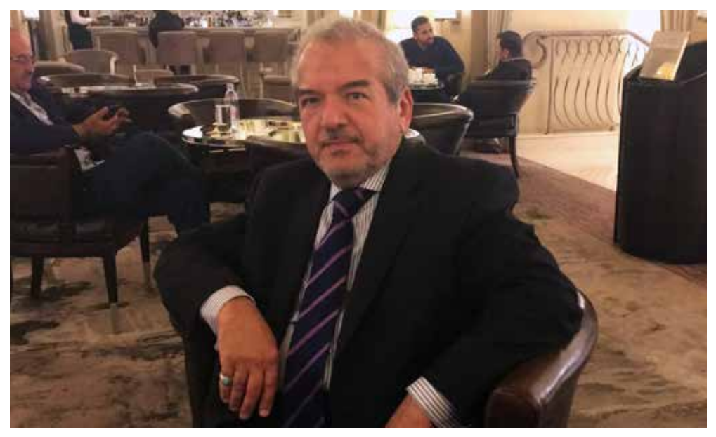
Deputy Minister for National Security Affairs Akeel al-Saffar.

A long-serving Iraq security official discusses the future of the al-Hashid al-Shabi program and outlines a proposal for providing security services to investors.