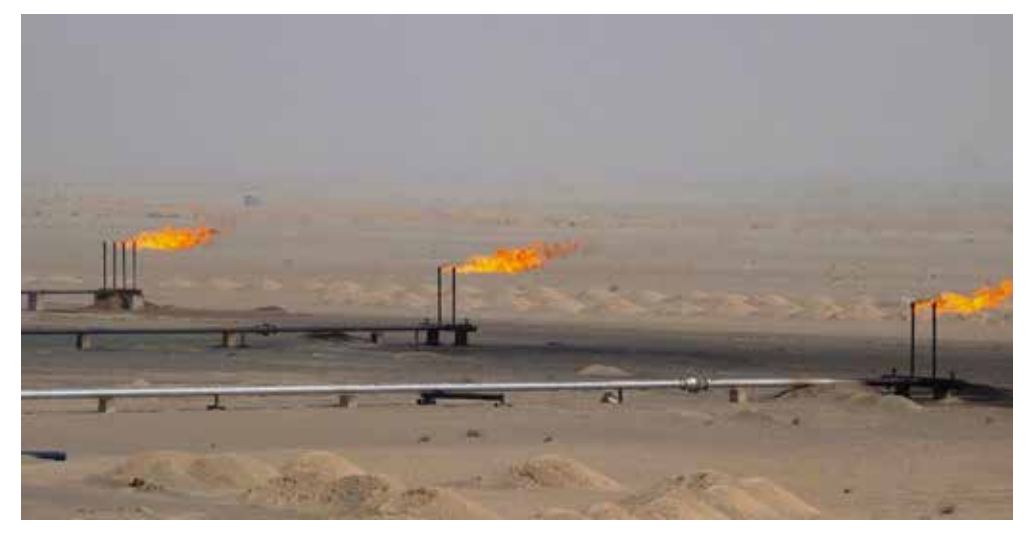
Flares burn at the Nassiriya oil field in Dhi Qar province.

Its formal inauguration only came recently, however, in March 2017. The timing coincided with the run-up to Iraq's provincial elections, which are scheduled for September.