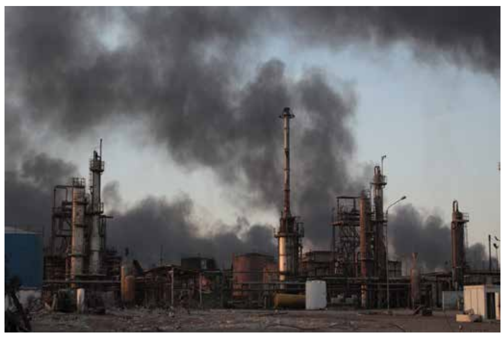
Qayarah refinery after liberation, Nov. 22, 2016.

10 YEARS OF INFORMING, ENGAGING AND EMPOWERING STAKEHOLDERS IN IRAQ | MARCH 2018