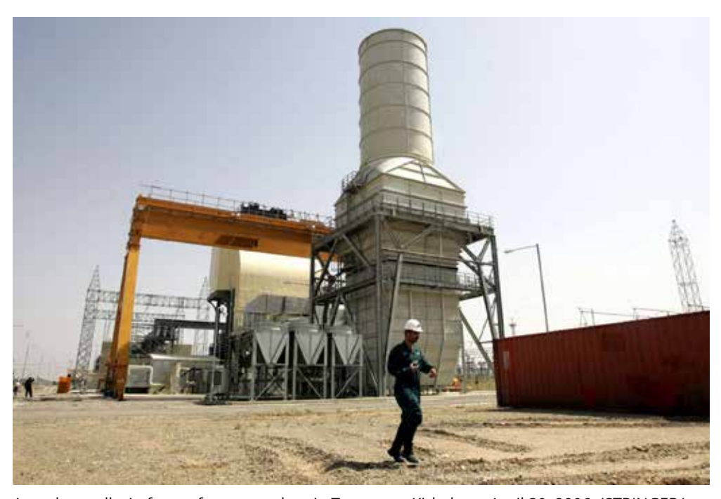
A worker walks in front of a power plant in Taza, near Kirkuk, on April 30, 2006.

In Basra, Missan, and Dhi Qar provinces, some residents have taken to the streets to protest the privatization of electricity metering and bill collection. In one incident, on Dec. 11, dozens of residents from Imam al-Sadiq district, north of Basra, protested by threatening to block roads leading to the Western Qurna 1 oil field.