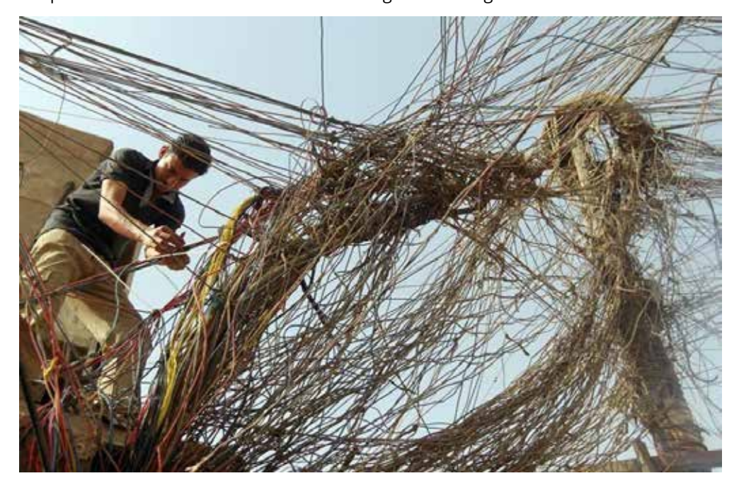
An Iraqi worker fixes wiring linked to a generator which provides electricity to a residential neighborhood in Baghdad during power cuts on April 10, 2012.

It wasn't just generator owners whose interests were threatened. Workers within the Ministry of Electricity had been benefiting for years by taking bribes from people who were stealing power from the government grid.